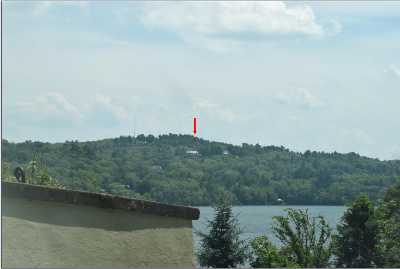
Looking Southeast from along W Lake Rd. The proposed monopine will be visible from this location.

Distance from the photographic location to the proposed site is 1.13 miles±